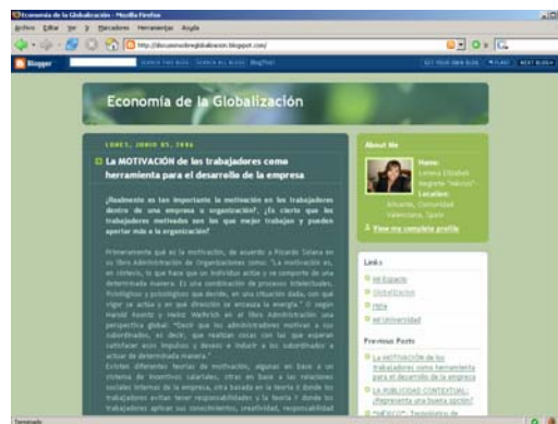
Fig. 3 A student weblog for "Global economy"