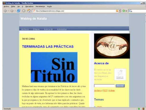
Fig. 5 A student weblog for "New technologies for education"