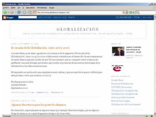
Fig. 2 Main page of the "Global economy weblog"

Moreover, the students have as a project to create and maintain a weblog through the duration of the course. Two students may work together and administer the same weblog. The weblog is evaluated at the end of the course and the students obtain a grade. In Fig. 3, an example of a student weblog for the course Global economy is shown.